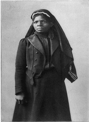
Susie King Taylor.

All visual sources (e.g., photographs, paintings, charts, graphs, etc.) must be credited on the exhibit and website and fully cited in the annotated bibliography.